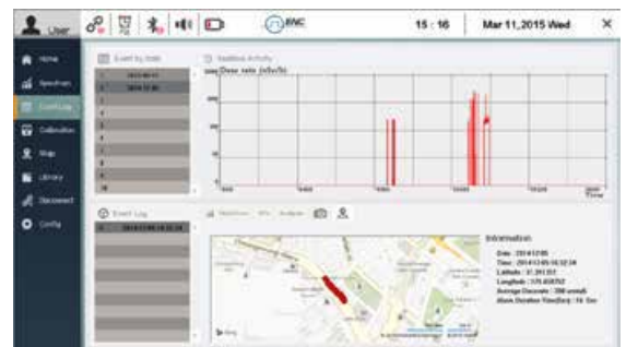
Event Log Screen